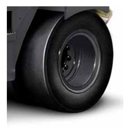
Combi with wide base tires

CC1300 VI and CC1400 VI Kubota V2403-CR E4B (T4) 50 hp