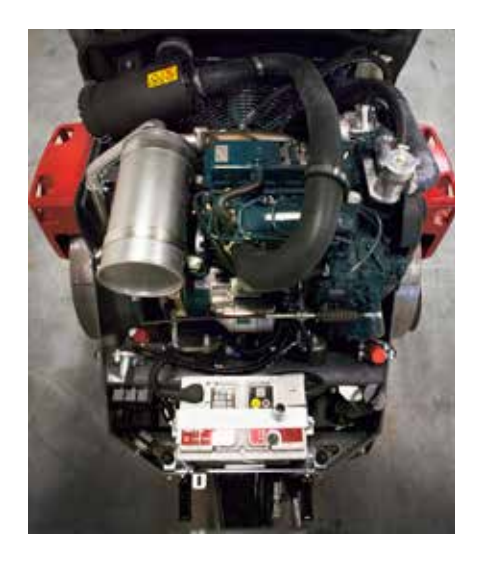
CC1100 VI and CC1200 VI Kubota D1703-DI (T4/V) 25 hp Kubota D1803-CR (T4/V) 37.5 hp

CC1300 VI and CC1400 VI Kubota V2403-CR E4B (T4) 50 hp